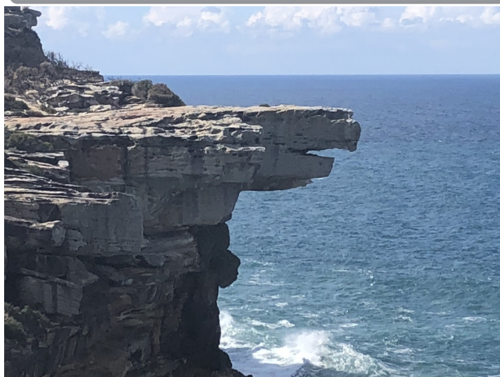
‘The Eagle’ Royal National Park

By Michael Burns of Rosebery #citysouthbeauty